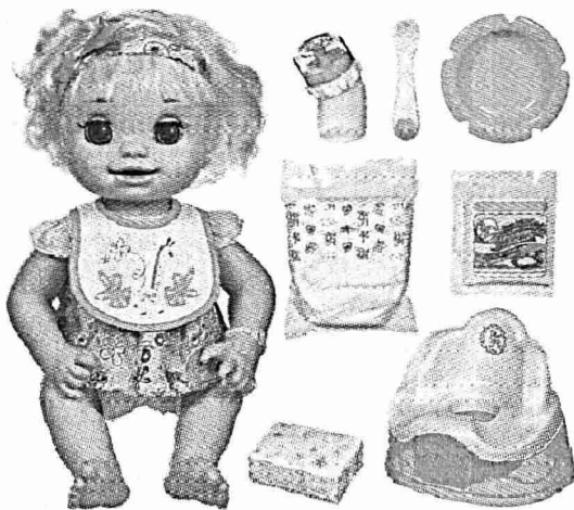
Baby Alive Learns to Potty

Printing imperfections present during scanning